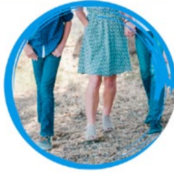
family or marital status