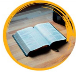
religious conviction or belonging to a religious denomination