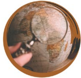
national or ethnic origin

Do not start working without a written employment contract!