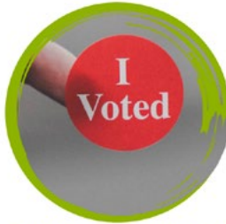
affiliation with a political party, employee trade union or other public organisation

except in cases where this may be of essential importance with respect to the work to be performed