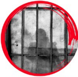
a previous conviction

except in cases where this may be of essential importance with respect to the work to be performed